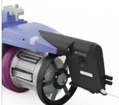
0 TO 50 Attivo

Tension set from 0 TO 50 cN with ATTIVO and up to 200 cN with Brake:.