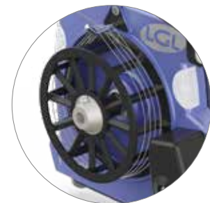
For elastic yarns