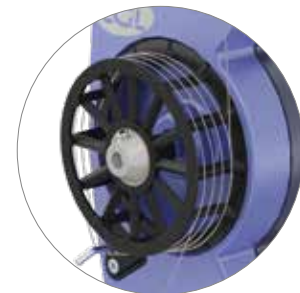
For elastic yarns