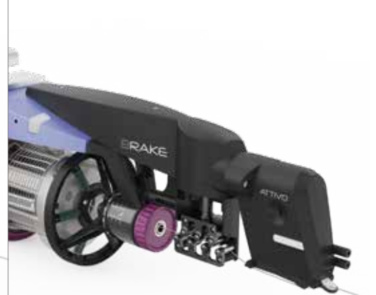
0 TO 200 Brake